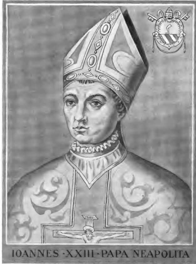
IOANNES · XXIII · PAPA NEAPOLITA